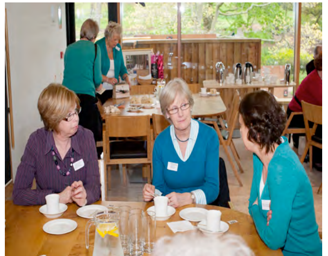
A jolly afternoon had by all.