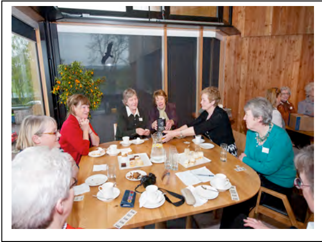
A group enjoying afternoon tea and a chat